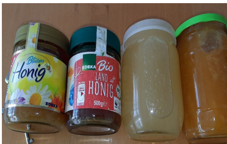
Figure 1. Honey samples prepared for analysis

Natural honey, including imported honey, can be introduced on the domestic market only if it meets the basic requirements stipulated in the Technical Regulation (HG nr 815, 2020).