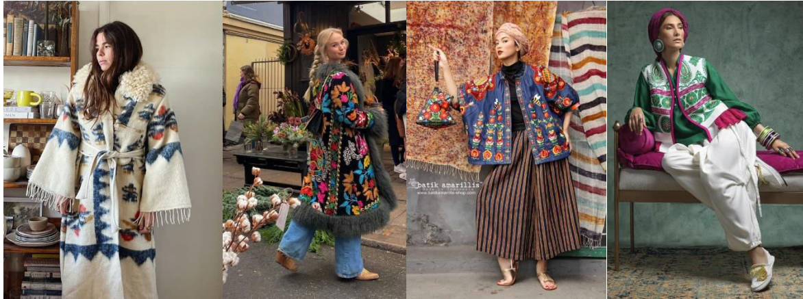
Figure 3. Combination of textures and materials when creating fashion collections

fabric paintings decorate clothes, shoes and bright accessories. The colors are quite diverse, which complements the image and creates unforgettable images. A special niche is occupied by jewelry in ethnostylistics, which is saturated with details and color. Looking at the assortment of ethnic collections, you can observe the trend of combining embroidery and knitting; modern elements with purely ethnic silhouettes, abundantly supplemented with authentic and stylized accessories [4].