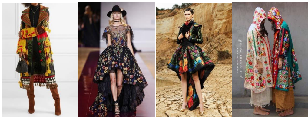
Figure 2. The use of ornaments in the collections of world designers

Many artists use Ukrainian motifs in their works. It can be both a traditional image and an abstraction based on Ukrainian ornament. Ukrainian ornamentation is an important element of cultural heritage that lives and develops in the modern world through the prism of the works of creative individuals who are devoted to the preservation and development of the national character. Such famous couturiers as Fashion House "Gucci", Prabal Gurung and Gareth Pugh, "Dior" John Galliano, Jean-Paul Gaultier, Moncler Gamme Rouge and many others used Ukrainian national motifs to create their collections [3].