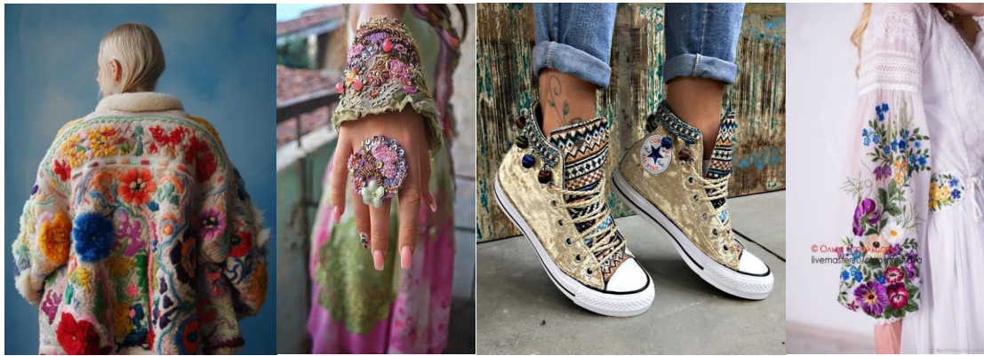
Figure 1. Transformation of embroidery into modern costume elements

The relevance of the analysis of the features of the development of ethnodesign stimulates researchers to study the motivational reasons and mechanisms of its development. Material, performance technique and the principle of artistic resolution of the image are important constituent factors of folk art. An important role is played by the shape of the products, their texture, ornamental motifs, plot images, which are expressed by graphic, pictorial or plastic means.